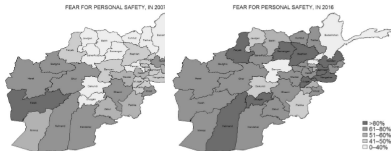
Fig. 1. The Asia Foundation (The Survey of Afghan People) [21]

Since 2015, Makassar has received a large number of displaced and migrant humanitarian migrants from Middle East caused by a civil war that has been going on for two decades. Over the past decade, around 3,870 Afghan migrants have arrived in Makassar under the UNHCR Program. [2] The presence of immigrants from Afghanistan in Makassar City requires them to interact with local residents, and they are required to adapt to the Makassar socio-cultural environment. In society wherever, cultural contact cannot be avoided so that intercultural relations become absolutes for the smooth interaction and communication in society and harmony and inter-ethnic relations is the absolute necessity to live a harmonious life. [3] Afghan refugees who come to Indonesia with a very diverse culture. The majority of ethnic groups in the city of Makassar are Hazara ethnic and become ethnic minorities within the Makassar City community. Their identity as migrants with many differences from the local community is reference for these refugees to construct their new identities.